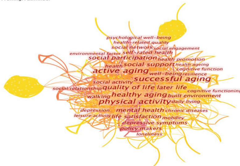
FIGURE 3 | Cluster map of keywords on successful aging and active aging.

CiteSpace, v. 5.7.R4 (64-bit) March 4, 2021 11:32:56 AM CST WoS: /Users/teaspoon02/Desktop/four aging policy (1990–2020) /successful ageing & active ageing /data Timespan: 2005–2021 (Slice Length=1) Selection Criteria: Top 10.0% per slice, up to 100, LRF=3.0, LBY=8, e=2.0 Network: N=640, E=2715 (Density=0.0133) Largest CC: 493 (77%) Nodes Labeled: 2.0% Pruning: Pathfinder