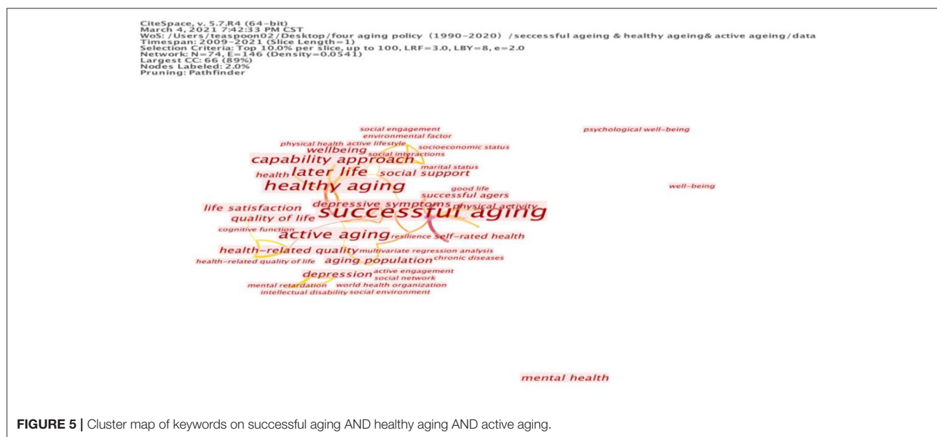
FIGURE 5 | Cluster map of keywords on successful aging AND healthy aging AND active aging.