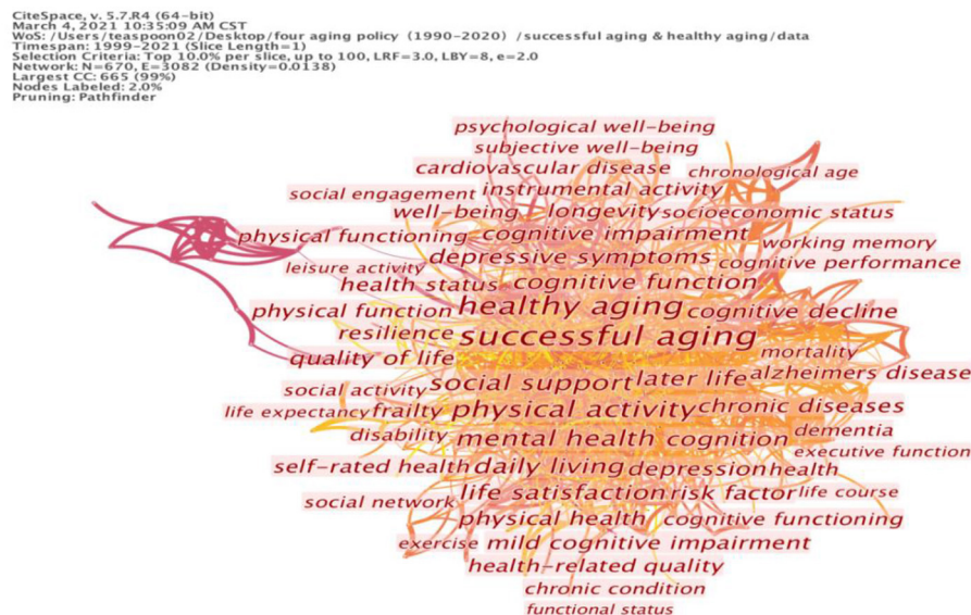
FIGURE 2 | Cluster map of keywords on successful aging and healthy aging.